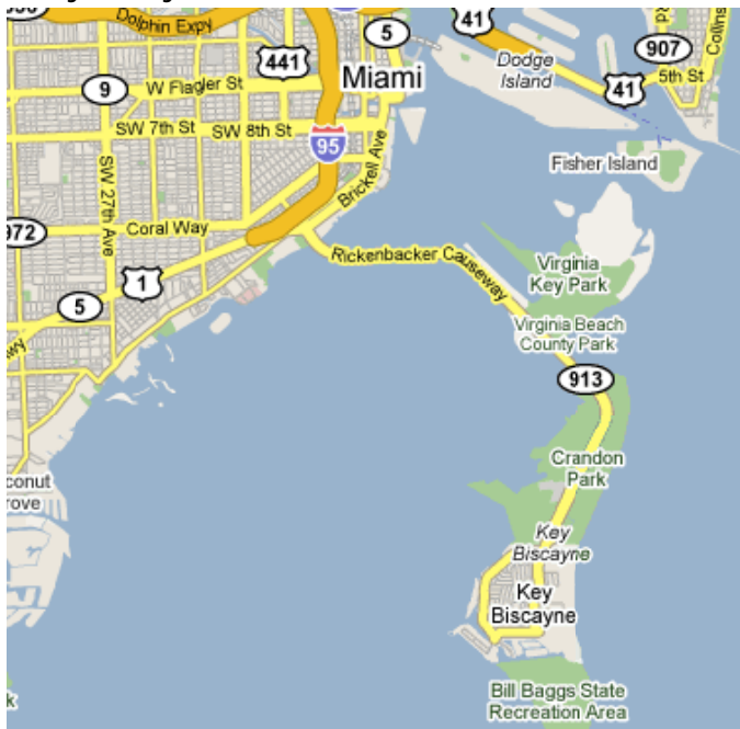
Biscayne Bay Aquatic Preserve